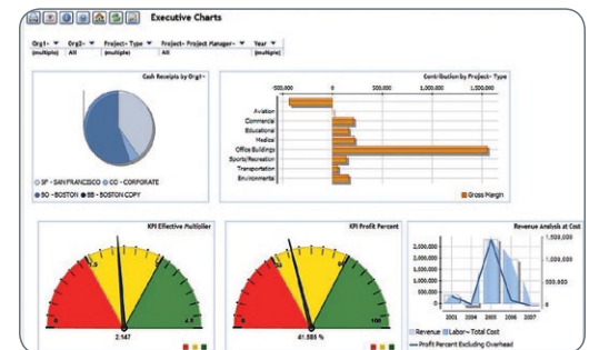
Fig. 2: The pre-configured Executive role-based dashboard provides data about the overall financial health of your business.